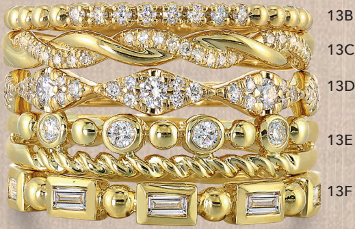
13B 13C 13D 13E 13F