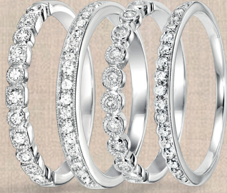
13G 13H 13J 13K